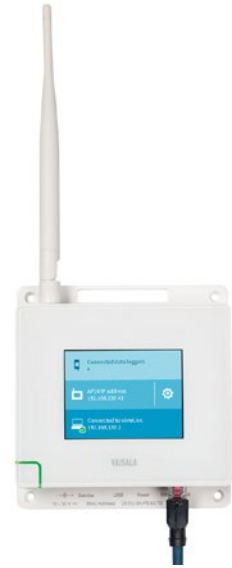
VaiNet AP10 network access point

The Vaisala viewLinc Monitoring System tracks environmental conditions wirelessly using Vaisala's VaiNet wireless devices based on LoRa®* technology. By using a modified chirp spread spectrum (CSS)* signal modulation, VaiNet provides robust communication that is extremely reliable over long distances and under harsh, complex and obstructed conditions. Long-range wireless communication eliminates the need for repeaters to boost signal strength. VaiNet's wireless data loggers and access points are pre-programmed to locate each other and establish communication. Less equipment and less configuration simplifies installation so users can deploy with little or no previous experience setting up networked monitoring systems.