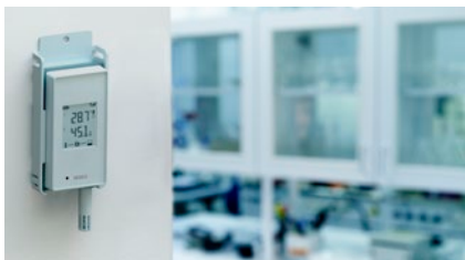
VaiNet RFL100 Radio Frequency Data Loggers

The Vaisala VaiNet Wireless technology uses sub-GHz frequencies to provide better signal propagation in environmental monitoring applications. Most industrial monitoring systems equipped with wireless devices use some sort of redundancy to protect against any single point of failure in a network of data loggers. VaiNet creates redundancy by distributing the signal load across several network access points. The wireless signal strength between access points and data loggers determines the optimum data path. Access points use Power over Ethernet (PoE) to reduce cabling and allow easy connection to a UPS*. A separate power supply is provided for installations where PoE is not available. Additionally, most RFL100 models are fully wireless, powered by batteries to ensure that the system continues monitoring during power outages. Each logger can maintain up to thirty days of data if the wireless network loses connectivity, and the access points provide additional data storage should the Ethernet LAN fail. As soon as the network is restored, data loggers and access points automatically backfill all historical data to the monitoring system software to ensure gap-free historical records.